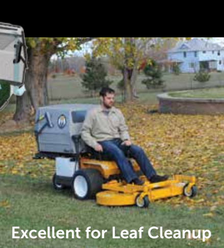
Excellent for Leaf Cleanup

Combination of hydrostatic transmission and custom gear axle provide a durable and precise drive unit for each wheel