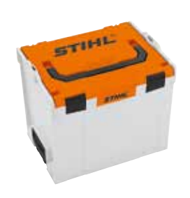
For AP or AR batteries and chargers.